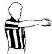
Stop Clock Signal