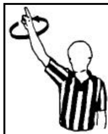
Shot Clock Reset